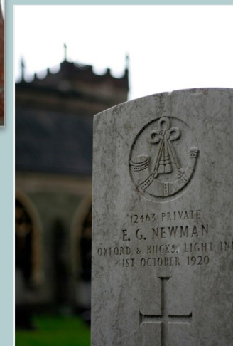
The Commonwealth war grave of Private Newman