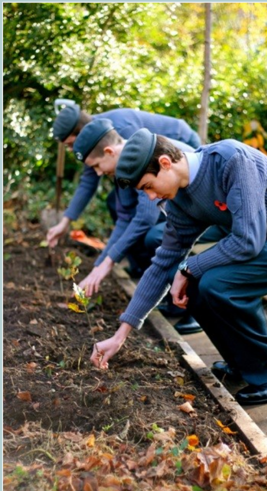
Air Cadets help plant Woodland Trust whips Remembrance Sunday November 2013

“This project will restore and tell the story of the historic churchyard of St Mary's, enabling more people to enjoy its tranquillity and discover more about the church's history.”