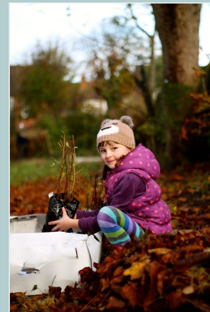
Planting Woodland Trust whips