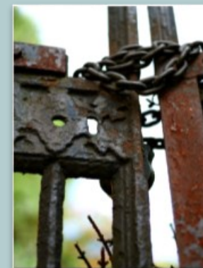
The West Gate